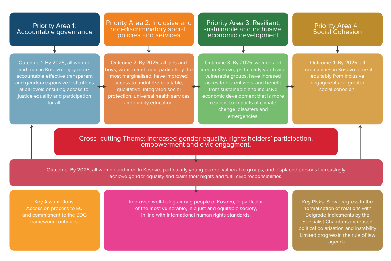
Figure 1 Cooperation Framework Theory of Change

These priorities represent the greatest importance to sustainable development in Kosovo. It is only by making significant progress in each priority area and cross-cutting theme guided by the principles of human rights, gender equality, and LNOB, that the SDGs will be achieved.