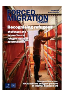
GP20 reflections and good practices FMR 65 – GP20 Special Feature: lessons and good practice. Forced Migration Review, November 2020