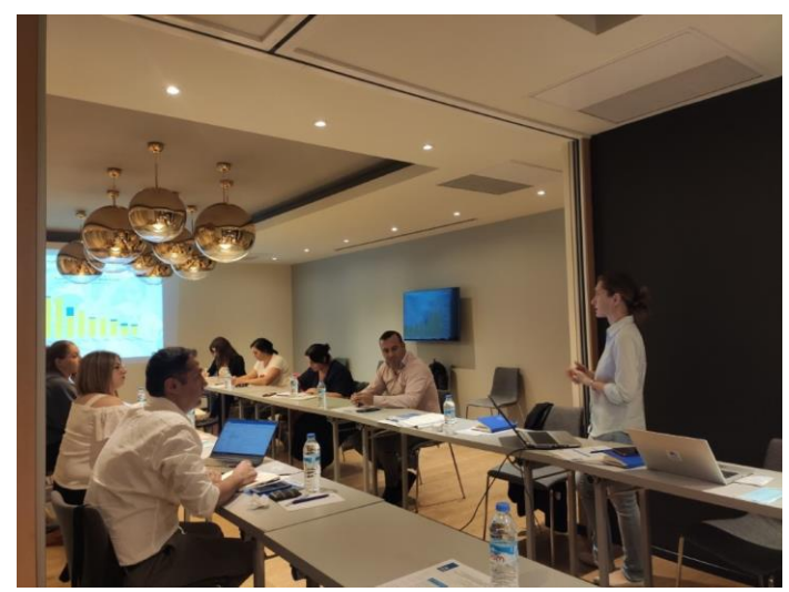
A network of 20 IDP volunteers from across Georgia was established in 2019. This network aims to improve two-

way communication between the government and IDPs. It also aims to foster durable solutions by strengthening the system of IDP referral to government services and supporting participation of IDPs in decisions affecting their lives. In September 2020, UNHCR organized the third meeting with the IDP volunteers together with representatives from central government and local municipalities. Participants emphasized the importance of IDPs' access to information and taking IDPs' needs and views fully into account.