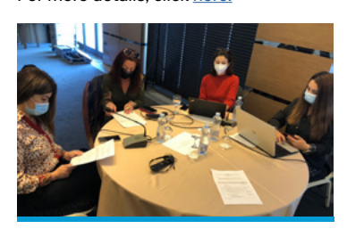
≥ 21 October, UNICEF