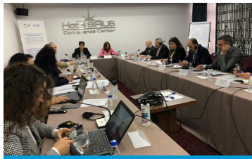
↘ 29 November, IOM

In addition to other participants, staff from the WHO Pristina office and two participants from the Institute of Public Health attended the training.