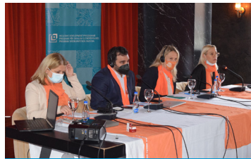
↘ 30 November, UN-Habitat