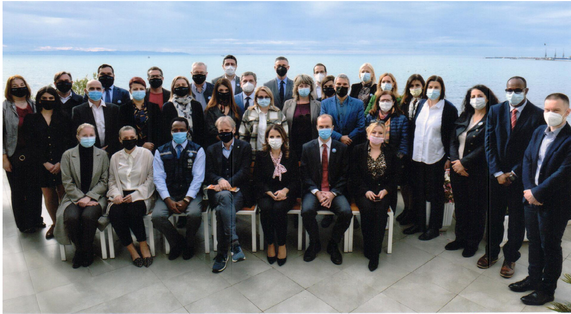
25-26 Nov 2021, Durres, Albania